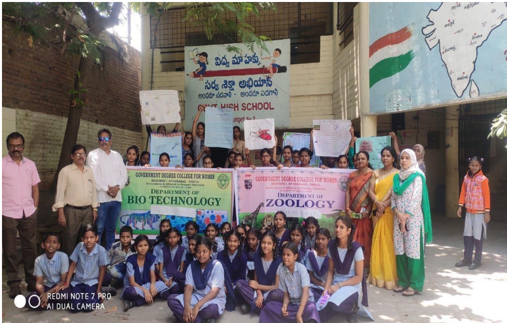
Distribution of Herbal Mosquito repellents to the students of Government High School, Begumpet.